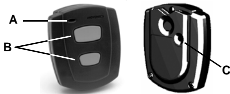
Figure 1 Transmitter external components

A Transmit LED B Activation buttons C Reset button