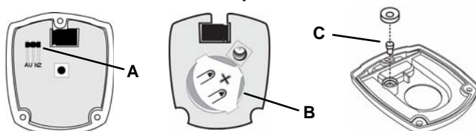
Figure 2 Transmitter internal components

A Frequency band selection pins B Battery C Reset button plunger assembly