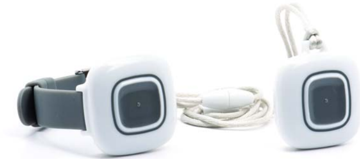
Figure 4 The Inovonics EN1221S-60 family of senior living pendants.