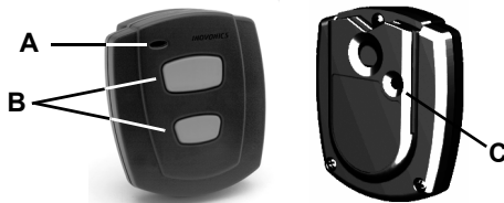
Figure 1 Transmitter external components

A Transmit LED B Activation buttons C Reset button