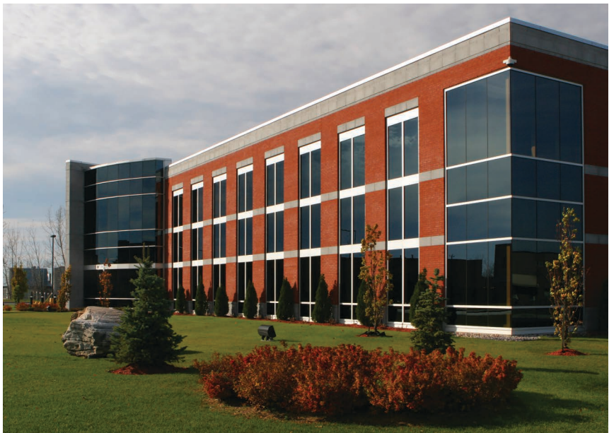
Figure 2 Multi-story office building

The security system needs to monitor the lobby, the elevator, and each office and floor. The medical offices require a high degree of monitoring due to the expensive equipment contained in the offices. The IT room of the e-commerce company needs special monitoring; in addition to the security devices necessary to protect the room from intrusion, the temperature and humidity must be monitored to prevent any equipment from overheating and failing. The receptionist in the lobby will also need a wireless pendant for any problems that could arise.