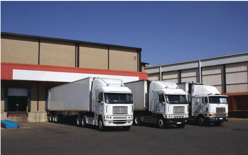
Figure 1 Distribution center

be managed and tracked, these facilities are large by their nature, translating into multiple entry points that must be monitored. We will primarily focus on monitoring against intrusion, including the access gates, the roadways to and from the building, and the building itself.