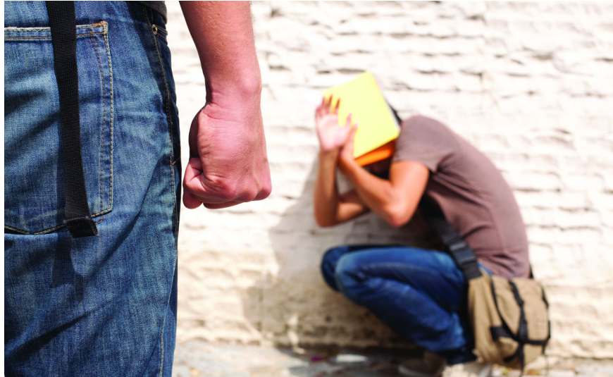
Figure 2 The majority of all students worry about being assaulted at school.