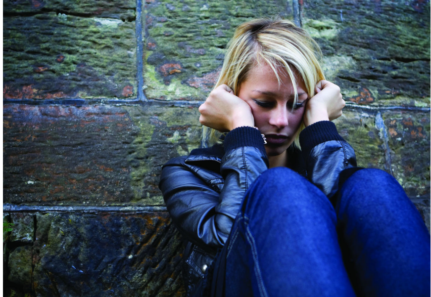
Figure 4 One study found that 78 percent of teens who had committed suicide had done so after experiencing bullying at school.

There are many lists of suicide risk factors, but they often miss one: being a victim of bullying and everyday violence. A 2012 study from the Archives of Pediatrics & Adolescent Medicine found that bullying more than doubled the risk of suicidal thoughts, and a second study that compiled media reports of 41 high-profile teen suicides found that 78 percent had experienced bullying at school. 11