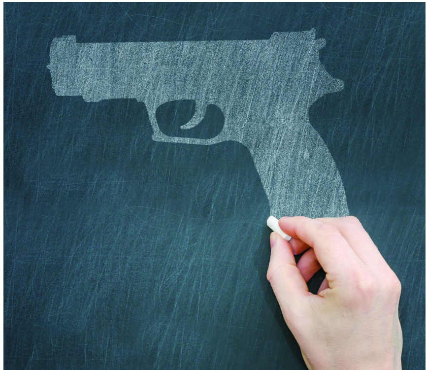
Figure 1 When most people think of violence in schools, they only think of school shootings.

When most people think of school violence, they think of school shootings. The media saturation that makes it unavoidable. However, school shootings are only the most extreme and rarest examples of school violence. The everyday violence in K-12 schools largely goes unaddressed, and can lead to catastrophic consequences without intervention.