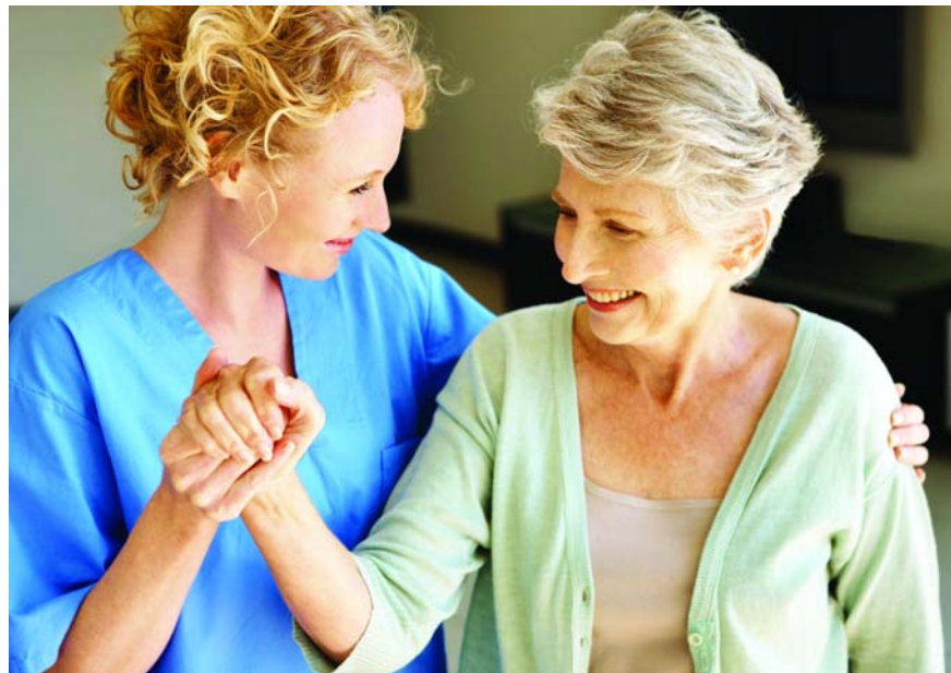
Figure 1 Emergency call systems provide peace of mind for residents and family members.

Emergency call systems are essential for the safety of residents.