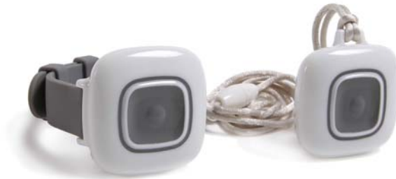
Figure 4 The Inovonics EN1221S-60 family of senior living pendants.