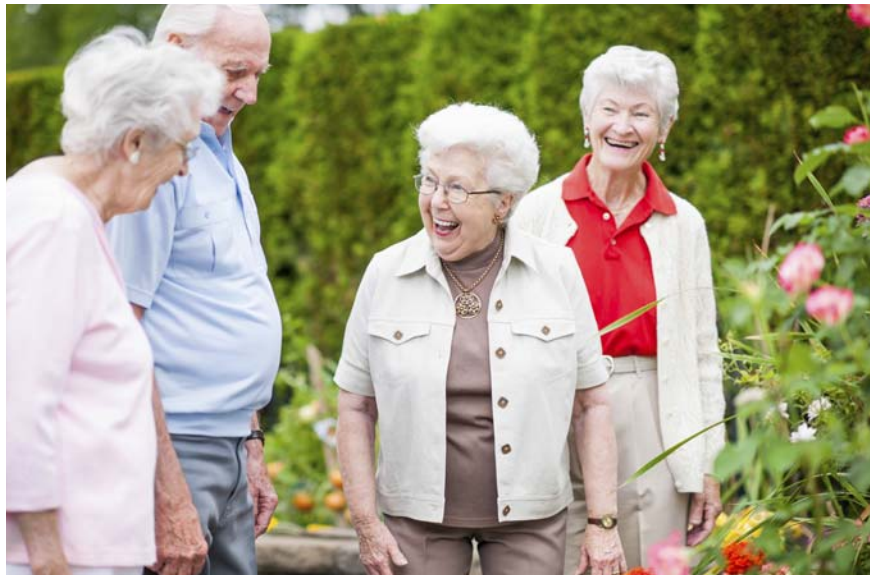
Figure 2 The mobile pendant must be comfortable and wearable.

Resident expectations are clear. The mobile pendant must be small, light and comfortable to wear. It must come with a variety of wearing options to accommodate resident preferences.