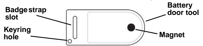
Figure 1 ACC680 components